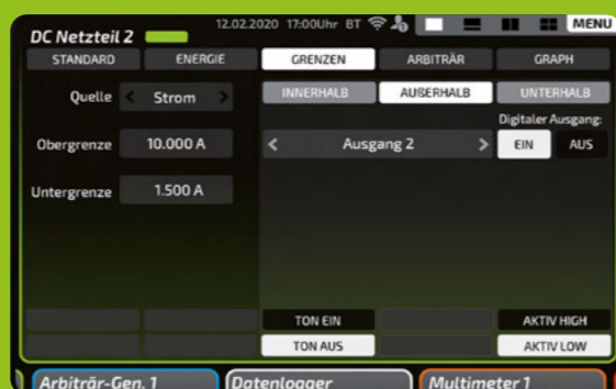
Limiter: The limiter allows the free monitoring of voltage and current ranges in conjunction with limits. Each state can be coupled with an acoustic signal and a freely selectable digital output.