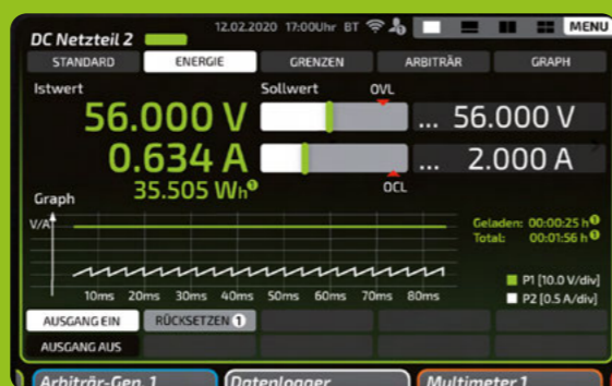
Energy meter: The new control power supplies record the power graphically and numerically at any time.