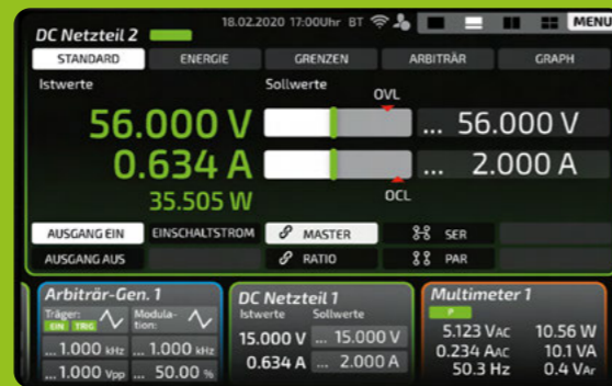
2/3 screen mode: After entering the values, the device bar can be easily moved by swiping gestures on the display or by 3D gestures (Smart scroll). The devices glide elegantly horizontally across the screen.