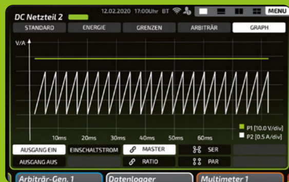
Data logger and graphic display of measured values: Visualisations and real-time recordings of freely programmable ramp functions for tracking voltage and current curves. Dynamically expandable in x/y direction by 2-finger spread gesture.