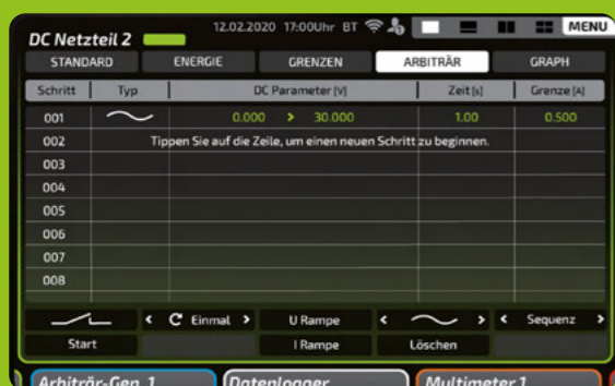
Ramp generator: Owing the 8-inch display, any sequences can be entered directly without any programming. This is a decisive advantage for daily work. Alternatively, the sequences can be transferred and started via the interface.