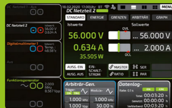
Connection panel and screen scaling: When the connection panels are displayed, all screens move to the right and adapt to the size. The values in the connection panel of the current assignment are clearly visible.