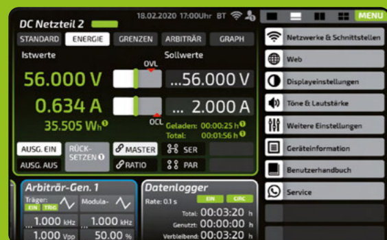
Menu bar and dynamic screen scaling: When the menu bar is displayed, the screen dynamically collapses and remains completely legible and operable during the display. Disturbing cross-fades of menus are thus completely avoided.