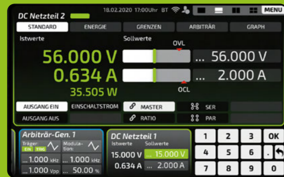
2/3 screen mode: Control setting unit in small window with numeric keypad. Even in the small window, the units can be operated and setpoints can be entered.